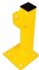
21" Flush End Post