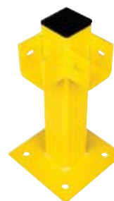
21" Corner Post