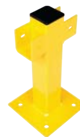
21" Intermediate Post