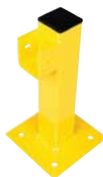
21" End Post