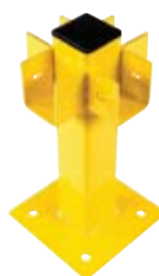
21" 4-Way Post