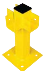
21" 3-Way Post

*Rail Dimensions are measured to center line of post, 4" square posts. "Any Size" special rail lengths can be ordered to meet your specifications. Bolts are included with rail piece.